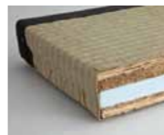
Foam sandwich rice straw tatami flooring (this has the humidity controlling effect and the feel of a natural material, but with added heat insulation)