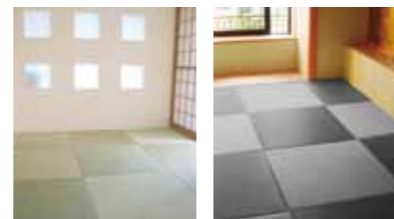
We disclose data from tests on residual pesticides, formaldehyde etc., and promise to provide a safe and secure life.