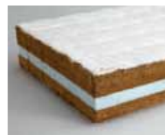
Tatami flooring (has a high degree of heat insulation, and is also hygienic)