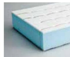
Ultra-lightweight tatami flooring (is less than half the weight of building material flooring, and is also very springy with excellent heat insulation properties)